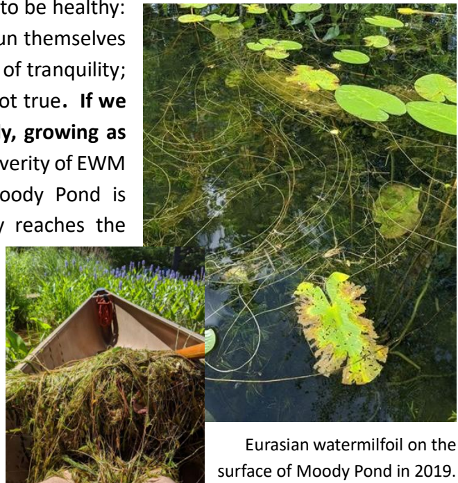
Eurasian watermilfoil on the surface of Moody Pond in 2019.

From the surface, Moody Pond's ecosystem appears to be healthy: the water sparkles, blue heron and painted turtles sun themselves on the log, and the call of the loon lulls us to a place of tranquility; so, it seems that the fight can now subside. This is not true. If we stop fighting now, the EWM will come back quickly, growing as much as an inch per day and up to 20 feet tall. The severity of EWM impacts varies from lake to lake, but because Moody Pond is relatively shallow and clear, enough sunlight likely reaches the bottom to allow heavy EWM growth across most or all of the lake bed. We could be right back at the beginning of the war in no time, and all of our efforts erased. To RESTORE Moody Pond, we must eradicate it. We can't afford not to, but actually... FMP can't afford to . At this time, our funds are such that we will be unable to continue the battle next year without your help.