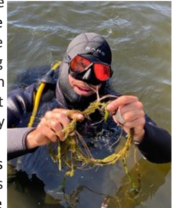
A diver hand-harvests Eurasian watermilfoil from Moody Pond.

We are determined to restore Moody Pond to the sparkling, pristine waterbody it's always been, but hand-harvesting has a high price tag. Hiring a 3-person dive team for three weeks comes at a cost of $19,200, so FMP must continue its fundraising efforts. Once the invasive EWM is controlled we will revisit our strategy and focus on long-term management.