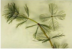
Aquatic invasive, Eurasian watermilfoil (EWM).

In the springtime, there's no sign of the Eurasian watermilfoil (EWM); but if we look below the surface, beneath the decaying dieback of the bottom, we'll see its root crowns lying in wait. This aquatic invasive species (AIS) spreads easily and grows at an alarming rate. It crowds out native plants, reduces biodiversity, diminishes fish habitat and negatively impacts wetlands. If left unmanaged, it can form thick, floating mats of vegetation, clogging the water and hindering recreation. In short, the pond's entire ecosystem is threatened.