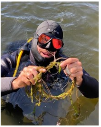
A diver hand-harvests Eurasian watermilfoil from Moody Pond.

We are determined to restore Moody Pond to the sparkling, pristine waterbody it's always been, but hand-harvesting has a high price tag. Hiring a 3-person dive team for three weeks comes at a cost of $19,200, so FMP must continue its fundraising efforts. Once the invasive EWM is controlled we will revisit our strategy and focus on long-term management.